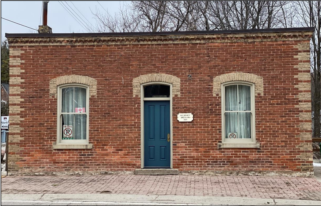
Alton Mechanics Institute: Repaired roof and associated flashing, repointed areas of exterior brickwork, restored windows and front door