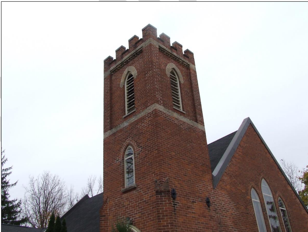
Bolton Heritage Conservation District: Repointed areas of Christ Church Anglican bell tower