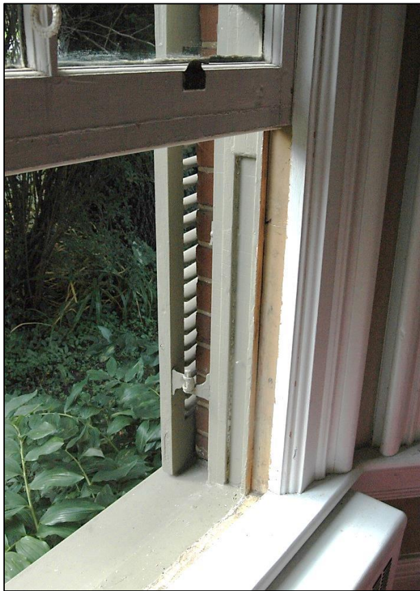
Goodfellow-Nattress-Potts: Replaced sash cords and installed weather seal on windows