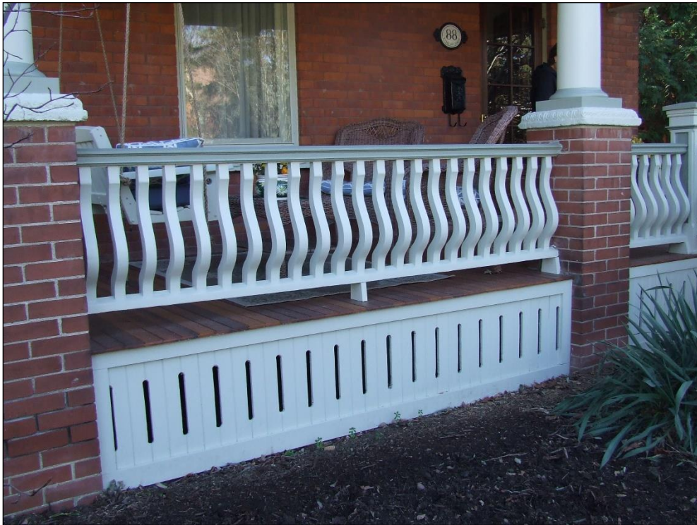
Bolton Heritage Conservation District: Restored front porch elements