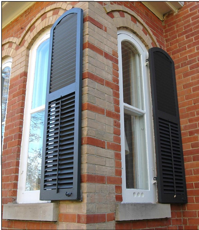
Little-Webber House: Repaired and repainted shutters