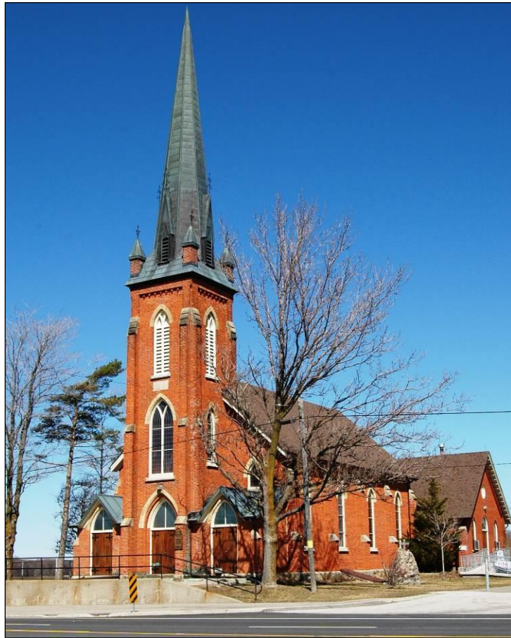
Claude Presbyterian Church: Repaired front gable fascia and soffits, painted exterior wood trim and exposed rafters in eaves