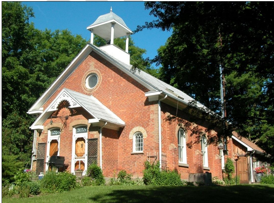
Silver Creek Schoolhouse: Repaired fascia, soffits, and bell tower