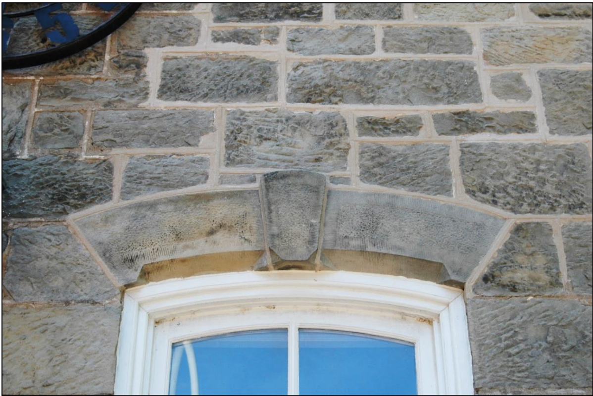
Sharpe Schoolhouse: Repointed areas of exterior stonework