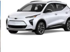
Chevrolet Bolt EUV - electric car