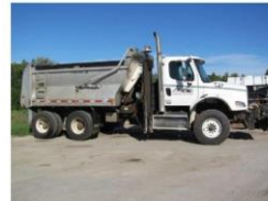
Tandem Axle Snowplow with plow and wing