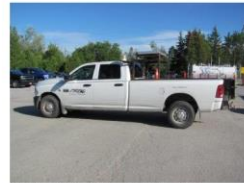
Medium Duty Pickup 4X4 Crew Cab