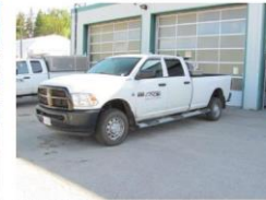
Light Duty Pickup 4X4 Crew Cab