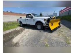
Heavy Duty Pick up with Plow plus slide in Sander Unit