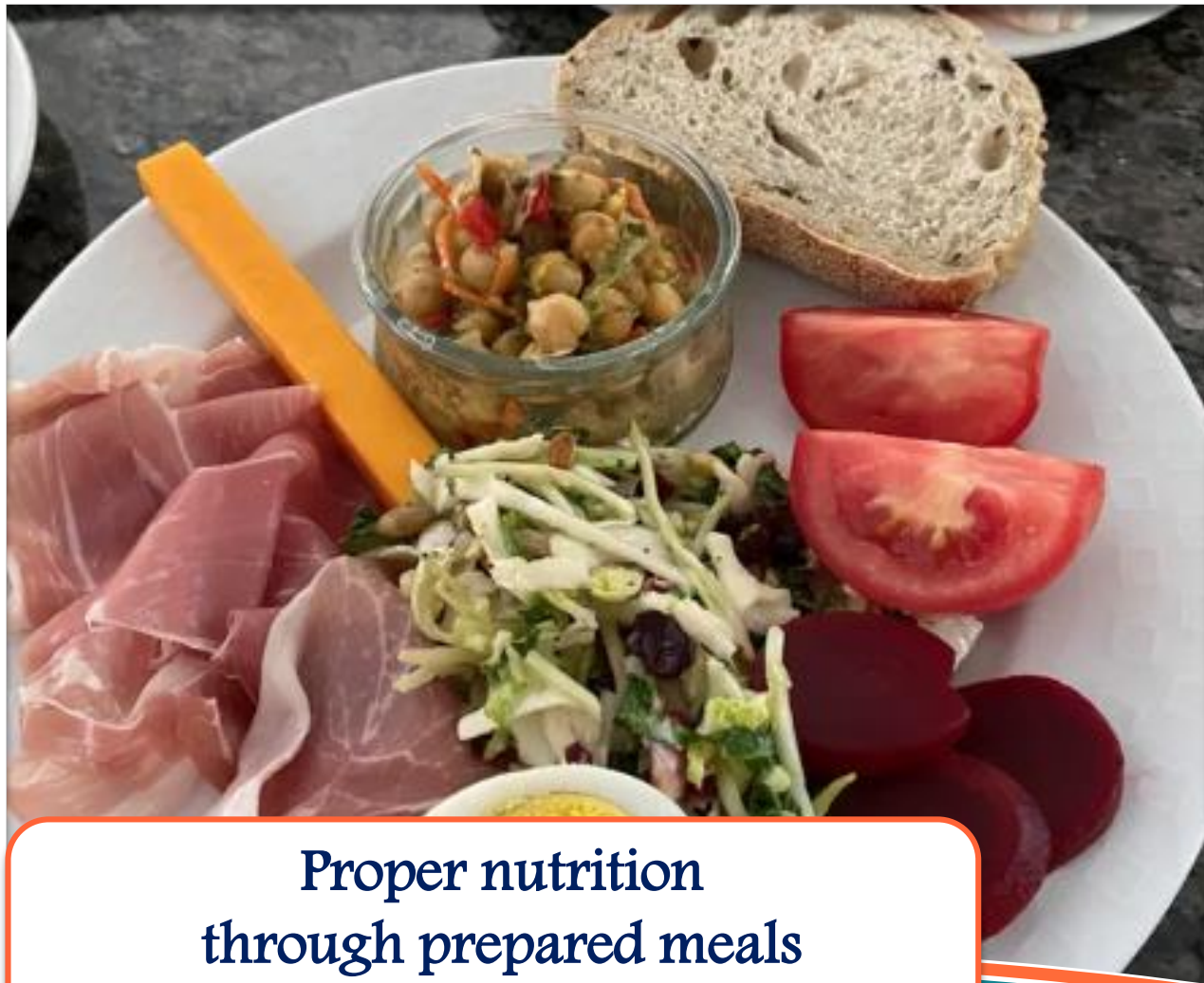
Proper nutrition through prepared meals