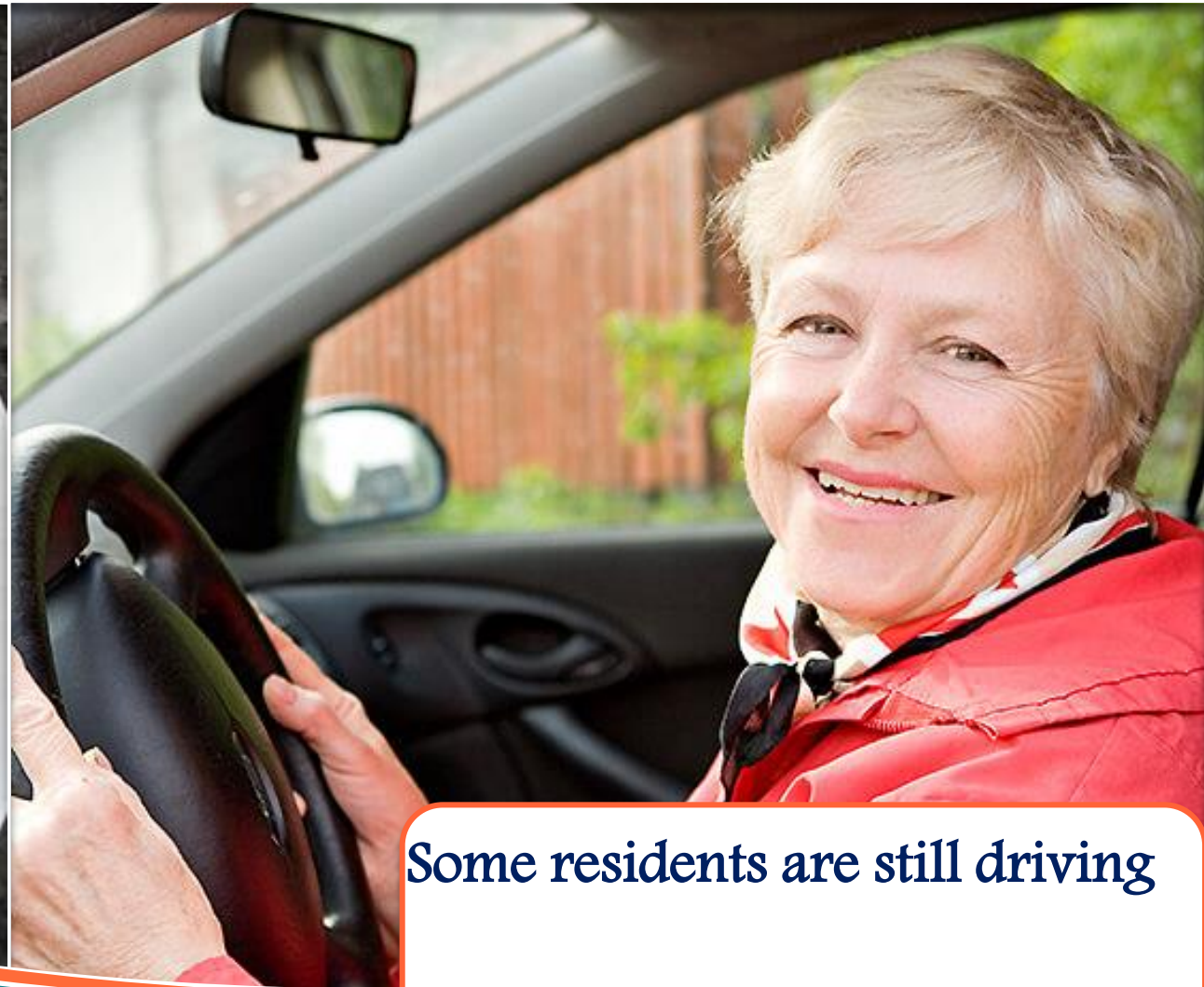
Some residents are still driving