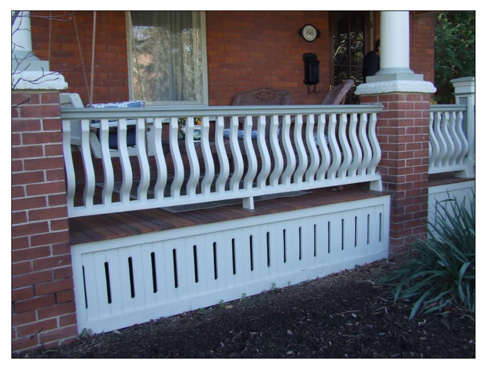
Image 3: Bolton Heritage Conservation District: restored front porch elements