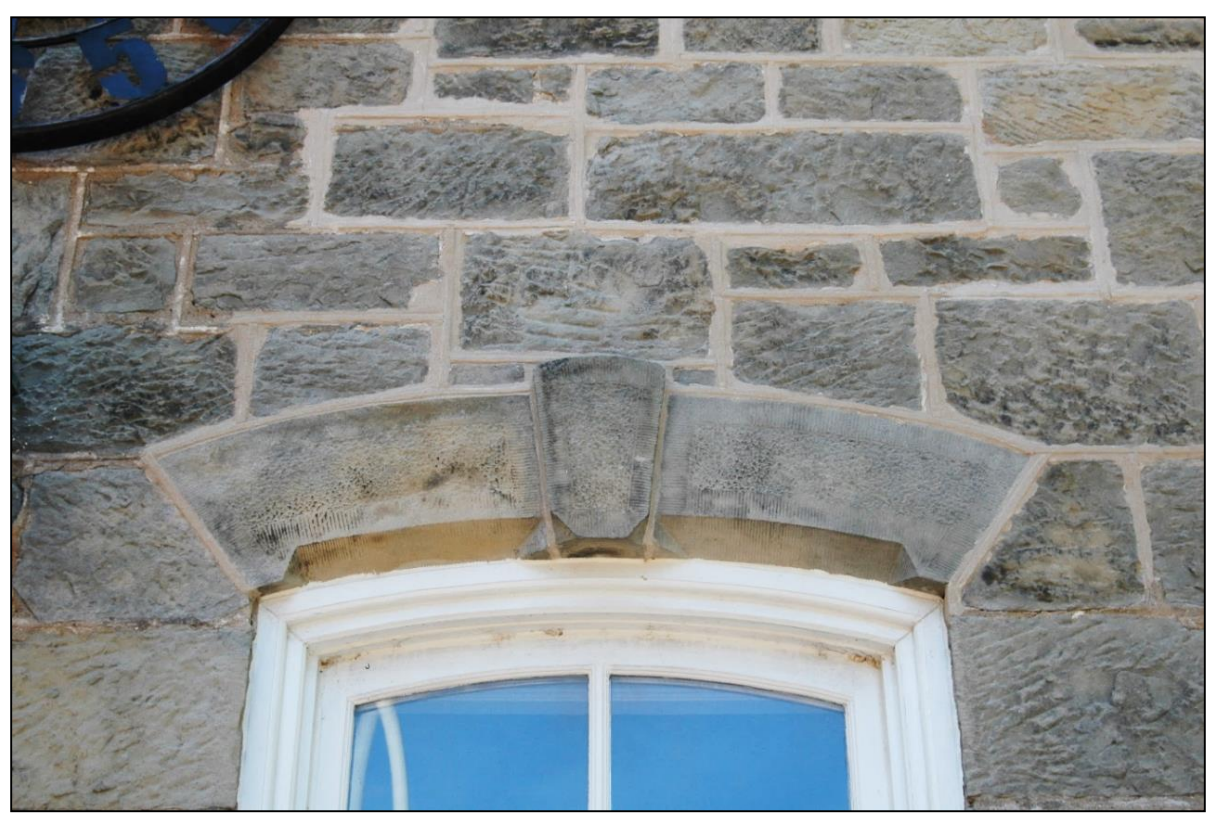
Image 7: Sharpe Schoolhouse: repointed areas of exterior stonework