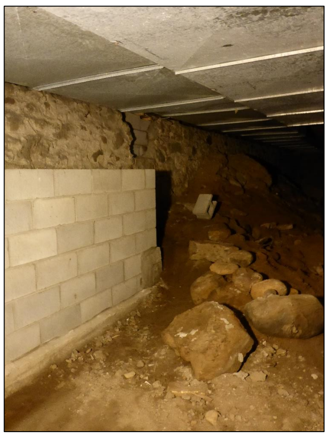
Image 6: Belfountain Village Church (17258 Old Main Street): emergency grant foundation repair