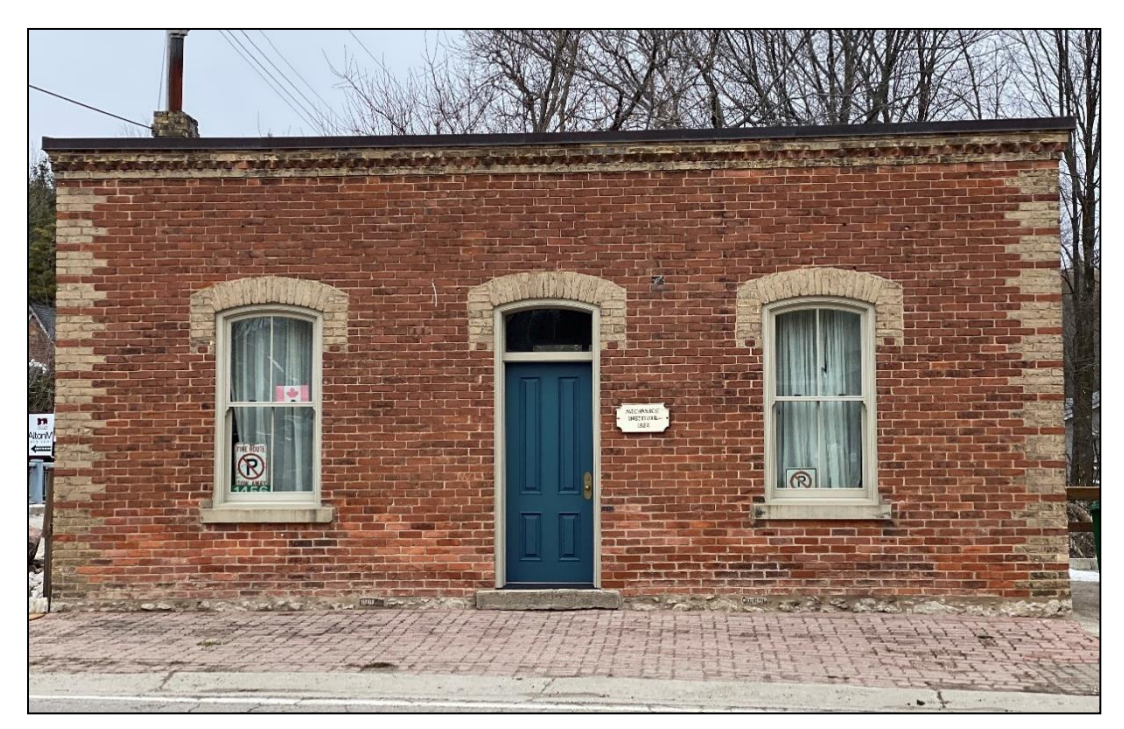
Image 1: Alton Mechanics Institute: repaired roof and flashing; repointed brickwork; replaced windows and front door