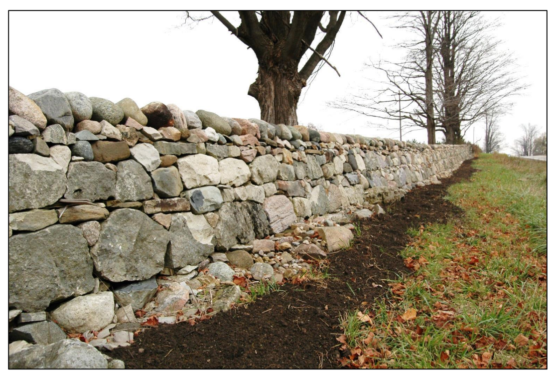
Image 11: Patullo-McDiarmid Dry Stone Wall: restored using existing stone and new cedar shakes.