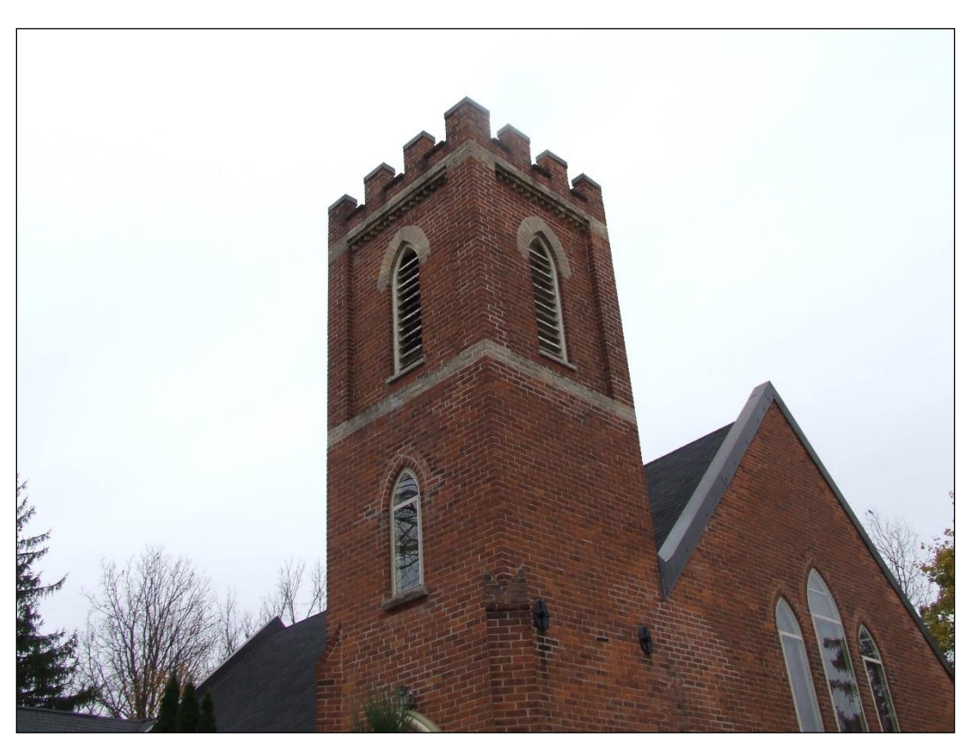
Image 8: Bolton Heritage Conservation District: repointed areas of Christ Church Anglican bell tower