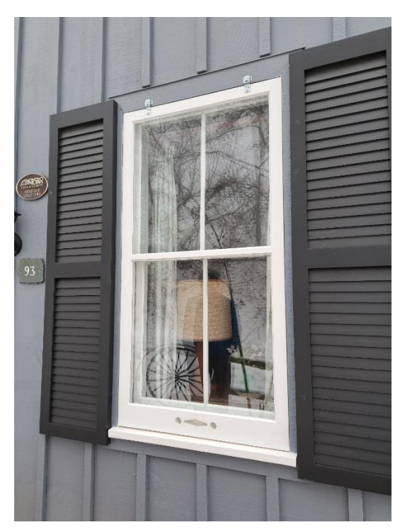
Image 12: Graham-Wilson-Pim House: restored wood windows with new wood storm windows.