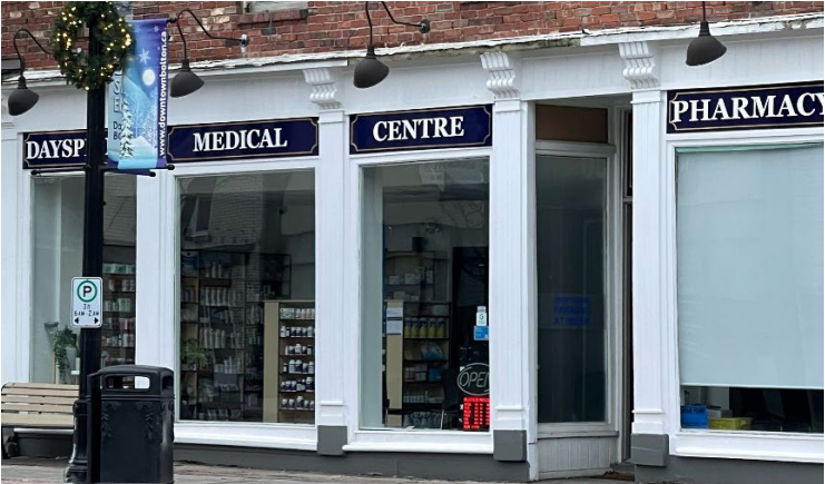
63 Queen Street N, Bolton Approved for: Façade and Energy Efficiency Retrofit (windows)