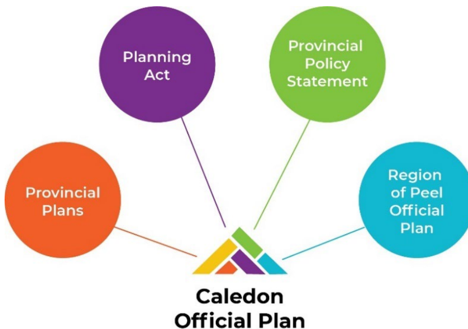
Figure 1-2: Legislative Authority and Policy Context

1.5.1 As shown on Schedule A1, Provincial Plan Areas, all lands in the Town are subject to one or more of the following Provincial land use plans. While this Plan has been prepared to conform with the Provincial plans, the entirety of each of those plans continues to apply, and any development in the Town must demonstrate conformity with the applicable Provincial plans.