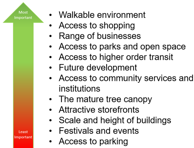
Figure 2. Most important change desired in the Focused Study Area.